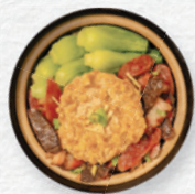
M4 Preserved Meat with Steamed Pork Patty on Rice 臘味肉餅飯 14 99