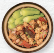
M3 Preserved Meat with Pork Ribs on Rice 臘味排骨飯 14 99