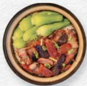
M2 Preserved Meat on Rice 臘味煲仔飯 14 99