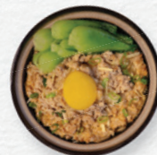
M8 Steamed Pork Patty with Poached Egg on Rice 高蛋肉餅飯 14 99