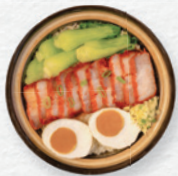
M1 BBQ Pork with Salted Egg on Rice 暗然銷魂叉燒煲仔飯 15 99