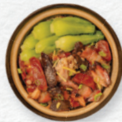
M6 Preserved Meat with Salted Fish on Rice 臘味鹹魚飯 14 99