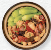
M5 Preserved Meat with Steamed Chicken on Rice 臘味滑雞飯 14 99