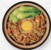
M7 Beef with Poached Egg on Rice 高蛋牛肉飯 14 99