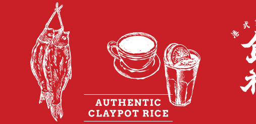
AUTHENTIC CLAYPOT RICE