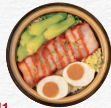
M1 BBQ Pork with Salted Egg on Rice 黯然銷魂叉燒煲仔飯 15 99