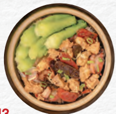
M3 Preserved Meat with Pork Ribs on Rice 臘味排骨煲仔飯 14 99