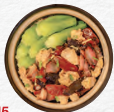
M5 Preserved Meat with Steamed Chicken on Rice 臘味滑雞煲仔飯 14 99