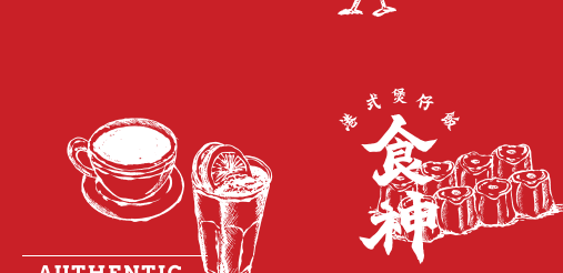
AUTHENTIC CLAYPOT RICE