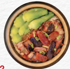
M2 Preserved Meat on Rice 臘味煲仔飯 14 99