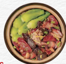
M6 Preserved Meat with Salted Fish on Rice 臘味鹹魚煲仔飯 14 99