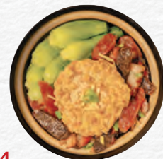
M4 Preserved Meat with Steamed Pork Patty on Rice 臘味肉餅煲仔飯 14 99