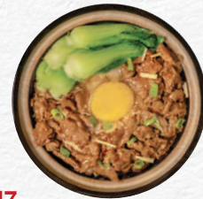
M7 Beef with Poached Egg on Rice 窩蛋牛肉煲仔飯 14 99